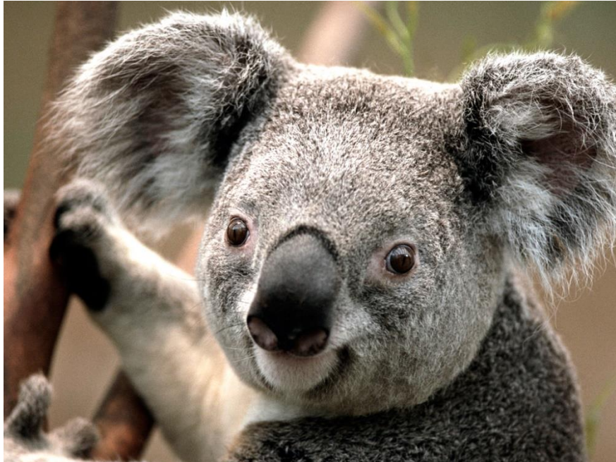
„Koala“ by Lucía Quiñónez is licensed under CC0 1.0