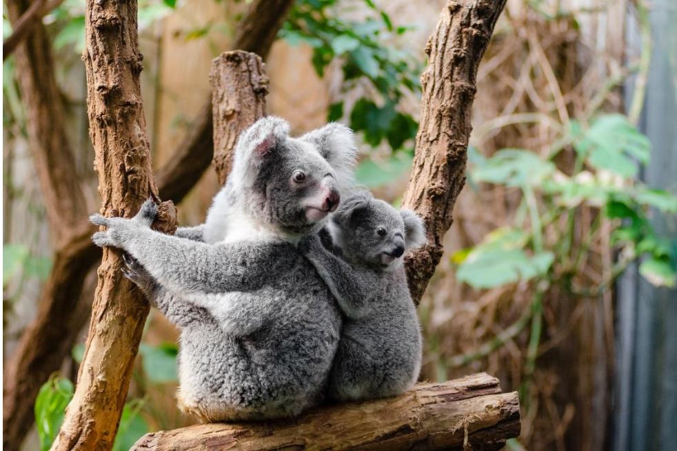
„Koala family“ by Matthias Appel is licensed under CC BY-NC 2.0